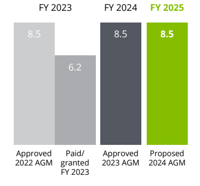
EXHIBIT 4: REMUNERATION APPROVED AND GRANTED FOR THE MEMBERS OF THE GROUP EXECUTIVE MANAGEMENT (IN MILLION CHF)

Long-Term Incentive Plan (LTIP) Three-year sharebased incentive plan fostering long-term value creation