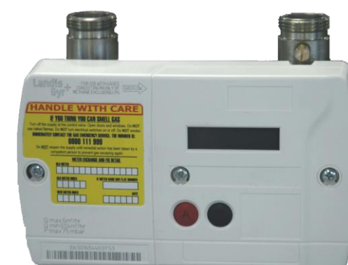
Landis+Gyr Libra310 Gas Meter